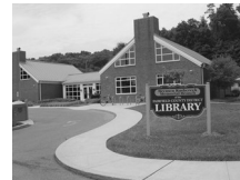
Bremen Rushcreek Memorial Branch & Early Literacy Center 200 School Street Bremen, OH 43107 (740) 569-7246