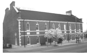
Main Library 219 North Broad Street Lancaster, OH 43130 (740) 653-2745